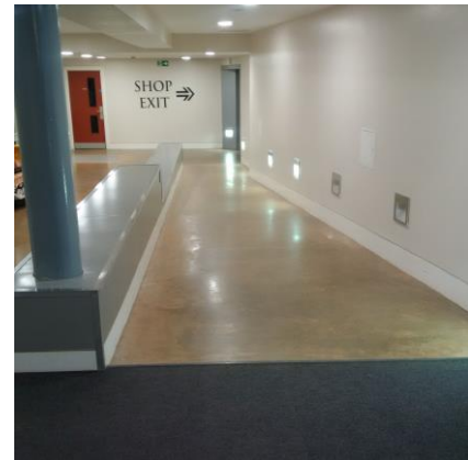
Fig. 4 – Slope and wide pathways on arrival and exit.