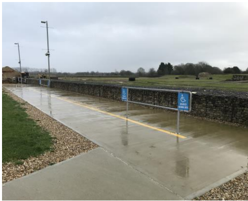
Fig. 3 – Disabled viewing arena.