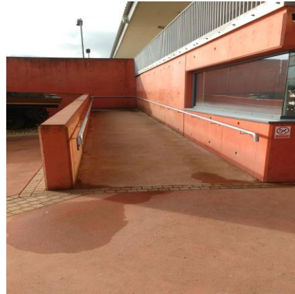
Fig. 2 - Ramp to arena.