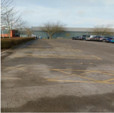
Fig. 1 – Disabled car parking bays adjacent to the museum main entrance.