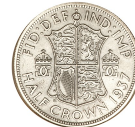
Half a crown = 30 pennies