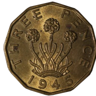
Three Pence = 3 pennies