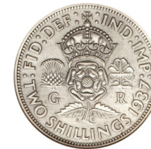
Two Shillings = 24 pennies