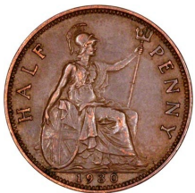
Half Penny = 1/2 penny