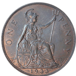
One Penny = 1 penny