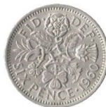
Sixpence = 6 pennies