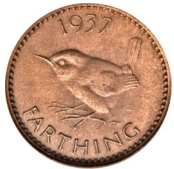
Farthing = 1/4 penny