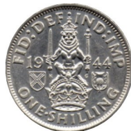
A Shilling = 12 pennies