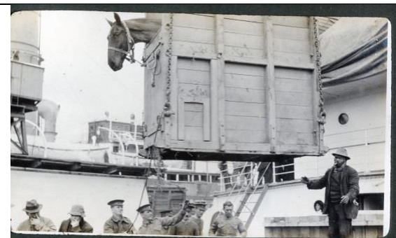
These pictures can all be seen in The Tank Museum 'Warhorse to Horse Power' exhibition.