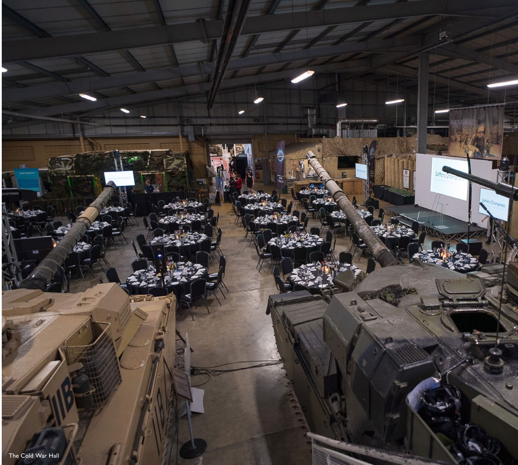
The Cold War Hall

Our facilities cater for 10-250 delegates. If you have a need for larger numbers, our team would be more than happy to try their best to accommodate any requests. Please contact them directly to start planning the perfect event!