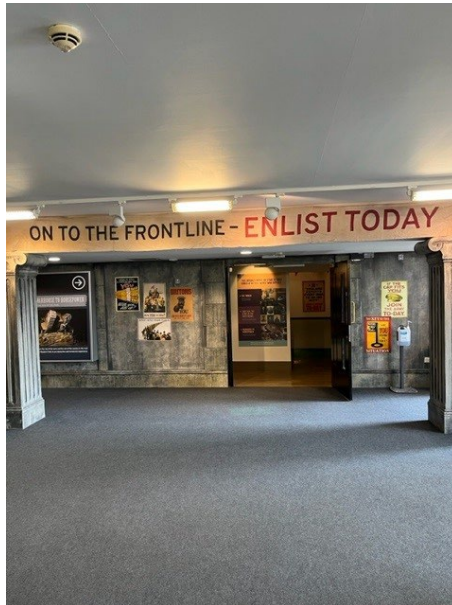
Figure 6 – Wide doorways to all exhibitions (WWI Hall Example)