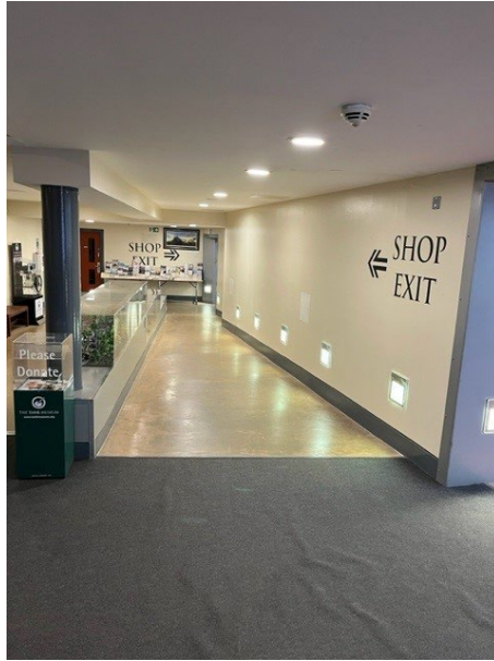
Figure 7 – Slopes for throughfare around museum (Shop & Exit Example)