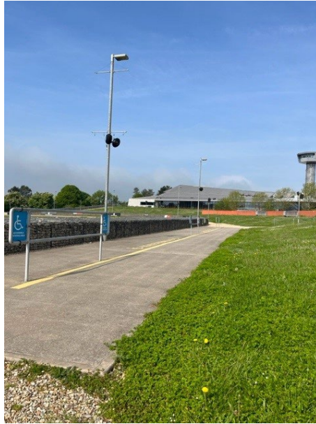
Figure 13 – Arena Accessible Viewing Area