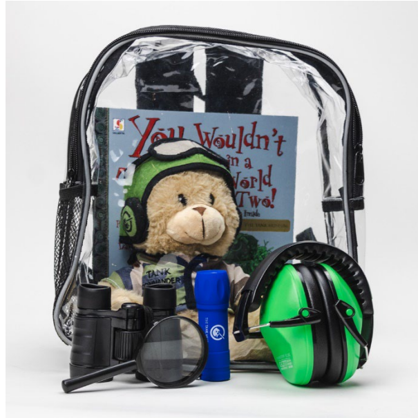
Figure 3 -Sensory Backpack Example