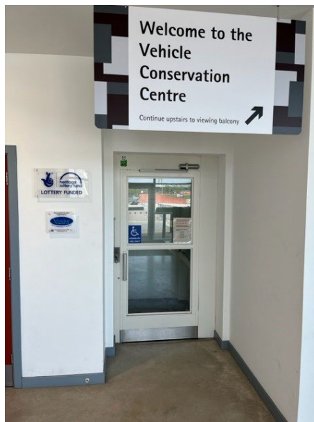
Figure 14 – Vehicle Conservation Centre Lift