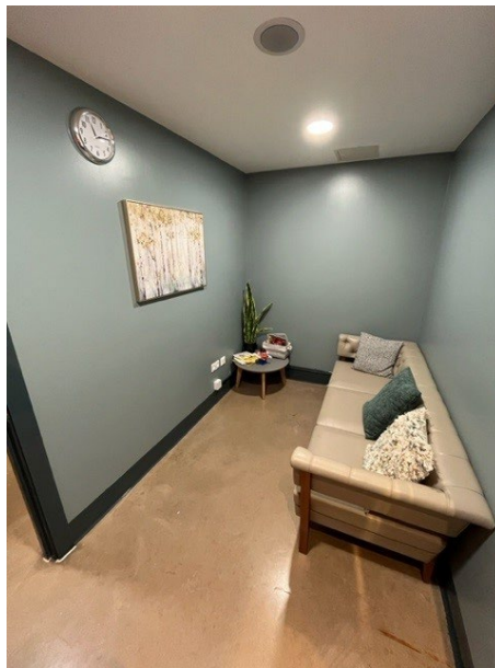
Figure 4 – Wellbeing Room