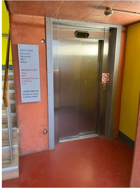
Figure 5 – Lifts Servicing all floors of the museum (Tank Story Hall Example)