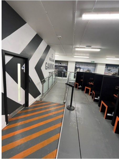
Figure 9 - Slopes for throughfare around museum (Gaming Zone Example)