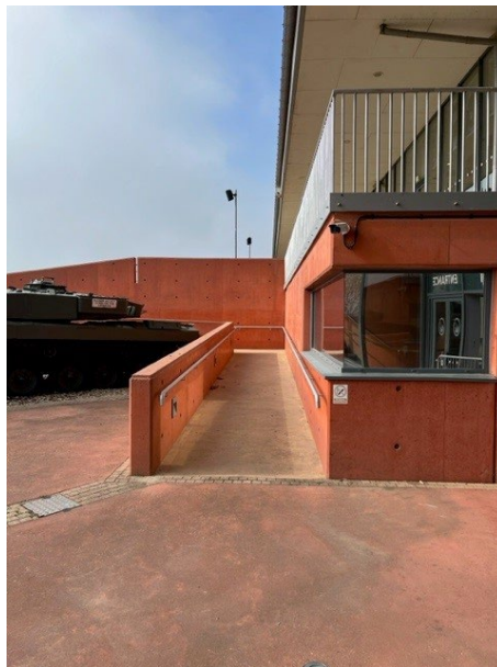
Figure 12 - Ramp to arena from Main Admissions