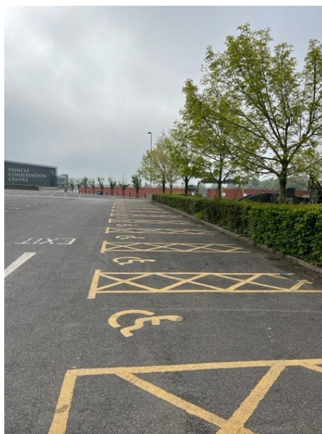
Figure 1- Disabled car parking bays adjacent to the museum main entrance.