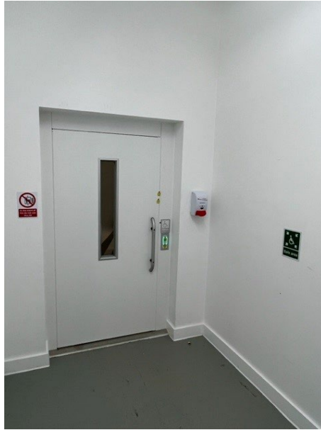
Figure 11 – Accessible Dwell Space