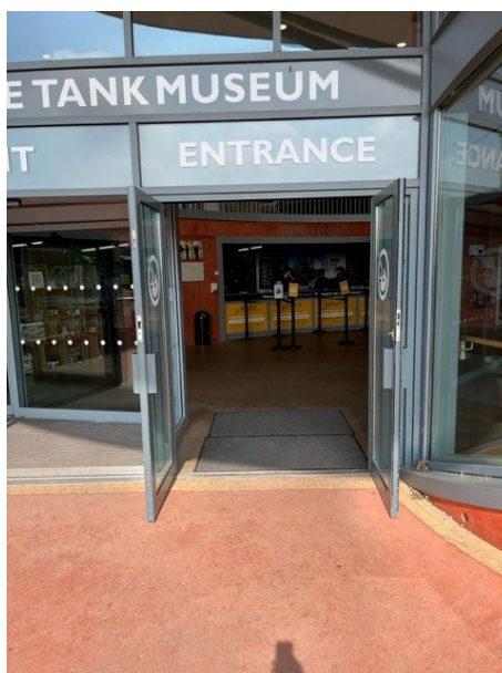
Figure 2 – Main Entrance