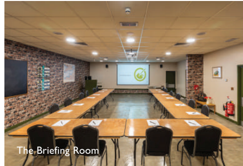
The Briefing Room

Right at the heart of the museum, set back from public view, the newly refurbished Briefing Room is the ideal space to hold any conference or lecture. Designed to replicate a WW2 briefing room, this unique space has access to private toilets, AV equipment and Wi-Fi access included. Everything you need to hold the perfect event!